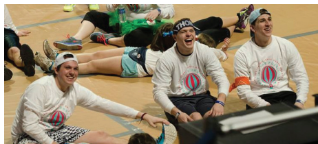
Kappa Sig dancers warm up on the floor of the Bryce Jordan Center before THON.

Thanks to our chapter's yearlong canning and fundraising efforts with Gamma Sigma Sigma, we contributed $78,771.47 toward Penn State's $13,343,517.33 total that will be