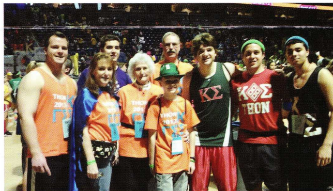
Alpha Delta with our 2013 THON family.