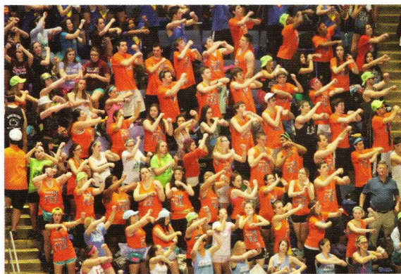
Kappa Sig and our sorority pair rock out from the stands at this year's THON.

We were able to rent the fraternity house at 232 East Nittany Avenue in State College. Twenty brothers will be moving in during the (2013-2014) school year (see picture on page 4). This is an official fraternity house, so we can now put up our letters. Please stop by next year to see our new home!