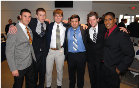
Alpha Delta's newest members.

When I decided to join the re-colonization of Kappa Sigma two years ago, I had no idea