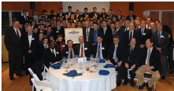
Alumni and active members with the new charter.