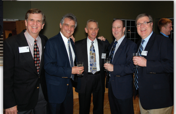
Below: Alpha-Delta alumni at the Installation Banquet.