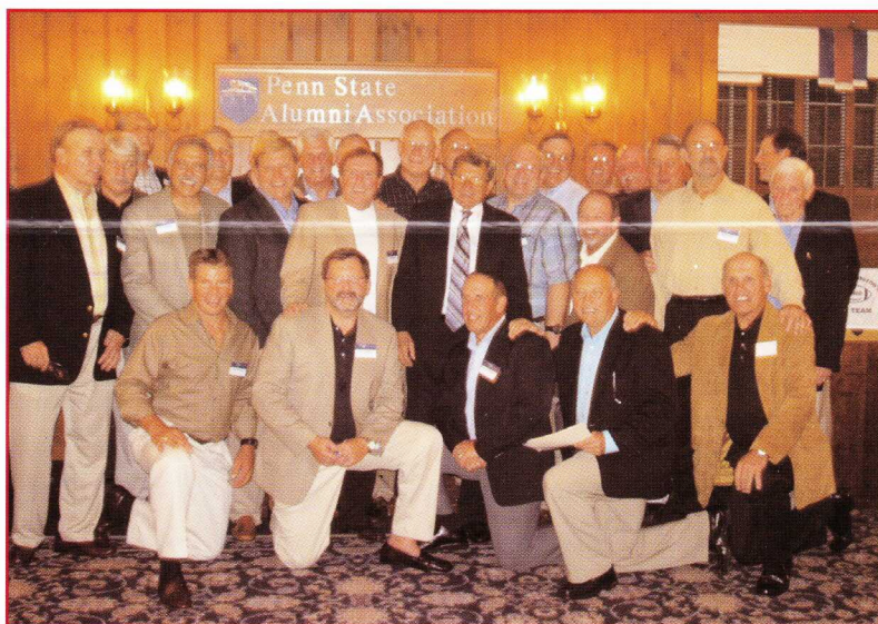
The 1966 Nittany Lion Team assembled for a reunion in 2006. Five Kappa Sigma alumni were there to celebrate Paterno's first team as head coach.