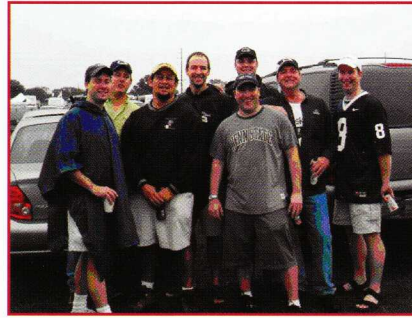
Kappa Sigma alumni from all over the U.S. met in Florida to cheer on Penn State in their Outback Bowl victory. They also took every opportunity to enjoy each other's company.