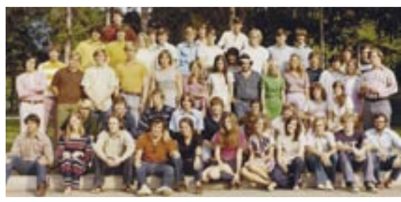
Alpha Delta Chapter, Spring 1971

...when you can share them with the brotherhood at www.kappasigpsu.com ? Upload photos from your era today!