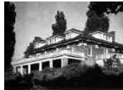
Kappa Sigma house 1942.