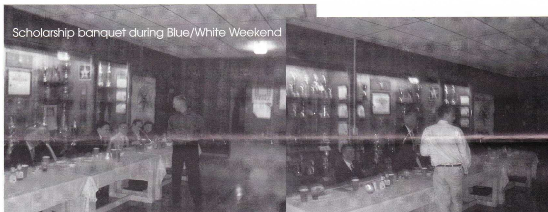
Scholarship banquet during Blue/White Weekend

Remember that the alumni board represents the members at large. We are here to ensure that the affairs of the corporation are run properly and efficiently. We welcome all feedback, questions or ideas. Feel free to contact me at any time. We all look forward to seeing you back at the house in the near future.