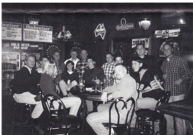
Alumni and undergrads enjoying each other's company before the Homecoming Parade.

We congratulate all of our brothers in their accomplishments and are excited to witness and be a part of the growth and prosperity of our chapter in the future.